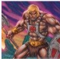
He-man Hero extraordinary