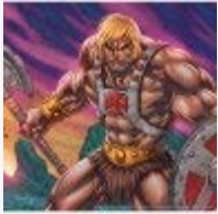
He-man Hero extraordinary