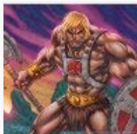
He-man Hero extraordinary