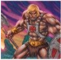
He-man Hero extraordinary

For all of you out there, if you don't think you can fall prey to the "law of reciprocity" after you left the cult, think again! We are vulnerable to mind control tactics.