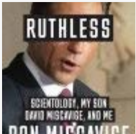
Out Ethics Out Ethics Ex Ethics Officer