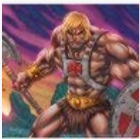
He-man Hero extraordinary