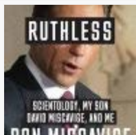
Out Ethics Out Ethics Ex Ethics Officer