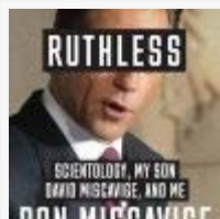
Out Ethics Out Ethics Ex Ethics Officer