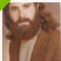
Red Valiant Patron with Honors